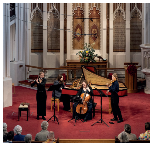
2024 winners Polychroma performing their winners' recital at LIFEM 2025.